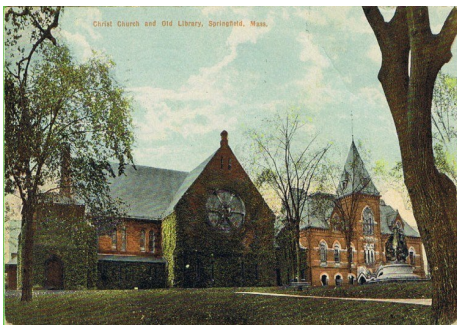
In 1909, after being moved, the Library was situated next to Christ Church.

By 1892 the Library had outgrown the building, and the city appropriated $18,498 for a new library building. A very unusual twist is that in order to be able to