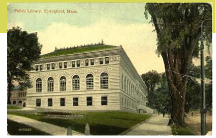
Central Library 1917

pink granite base, surrounded by white Vermont marble, with a frieze of white terracotta, and topped with a dark green tile roof. When it was time to move the books into the new building, City Librarian Hiller C. Wellman came up with an innovative plan. A trestle was built between the second floor of the old library to the main floor of the new one, a distance of 125 feet. An inclined gravity cable car system was devised, using two 6 foot by 2 foot boxes and with staff located at both ends, books moved quickly from the old to the new building. Books were immediately placed on the proper shelves, and the only books that could not be borrowed were those that were in transit! The move was completed in only eight working days.