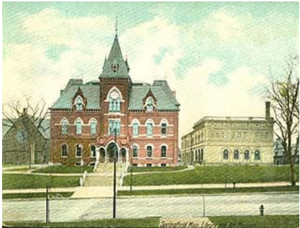
Original Springfield library, built in 1871, with Smith Art Museum to the right.

The earliest library, the Springfield Library Company was begun prior to 1796, and a printed catalogue issued on that date shows 320 volumes. Yet this and other libraries like it were not public libraries, but were limited to specific groups of people. The first general law