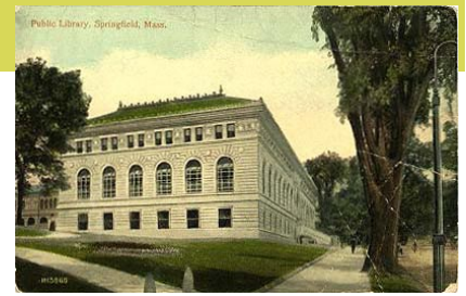
Central Library 1917

pink granite base, surrounded by white Vermont marble, with a frieze of white terracotta, and topped with a dark green tile roof. When it was time to move the books into the new building, City Librarian Hiller C. Wellman came up with an innovative plan. A trestle was built between the second floor of the old library to the main floor of the new one, a distance of 125 feet. An inclined gravity cable car system was devised, using two 6 foot by 2 foot boxes and with staff located at both ends, books moved quickly from the old to the new building. Books were immediately placed on the proper shelves, and the only books that could not be borrowed were those that were in transit! The move was completed in only eight working days.