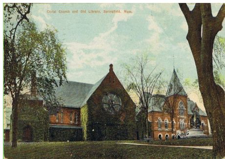
In 1909, after being moved, the Library was situated next to Christ Church.

By 1892 the Library had outgrown the building, and the city appropriated $18,498 for a new library building. A very unusual twist is that in order to be able to